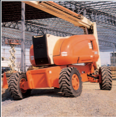
Narrow Fixed Width - Low GVW