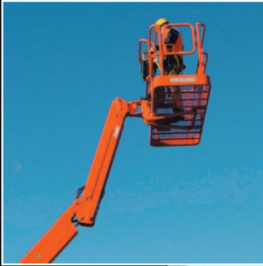
Extra Reach and Versatility