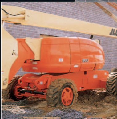
Proven Jobsite Performance